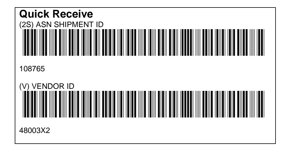
Figure 2 - A Quick Receive Label for receiving at Truck Division only.

In Figure 2 above, the bar code lines contain the embedded characters of 2S with the ASN number 108765, and a V with the Supplier Code/Vendor ID 48003X2. The human readable numbers are printed below the bar code lines for visual impact. This example provides an optional approach for shipments sent to the Truck Division. Engine Division cannot scan and process barcodes following the above example.