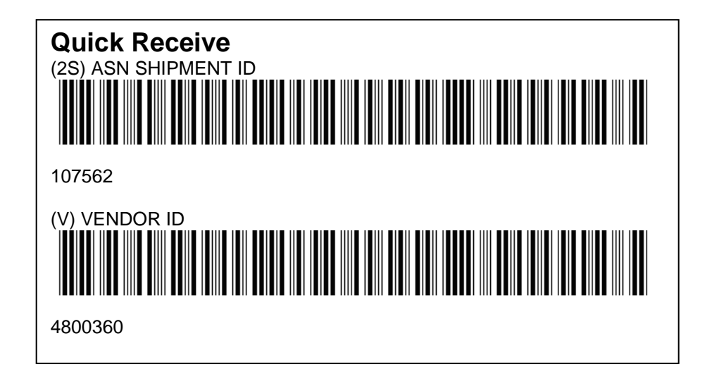
Figure 3 – A Quick Receive Label for receiving Service Parts.

In Figure 2 above, the bar code lines contain the embedded characters of 2S with the ASN number 108765, and a V with the Supplier Code/Vendor ID 48003X2. The human readable numbers are printed below the bar code lines for visual impact. This example provides an optional approach for shipments sent to the Truck Division. Engine Division cannot scan and process barcodes following the above example.